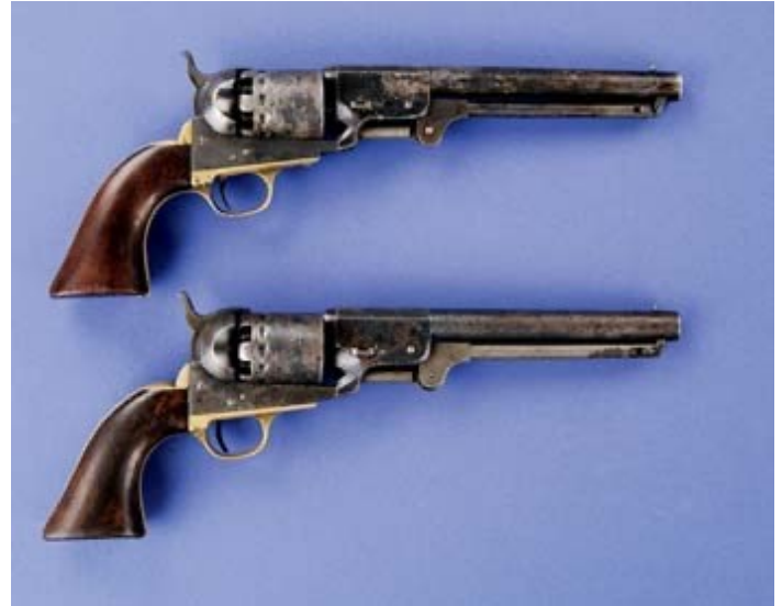
These Rigdon-Ansley pistols, SN 1774 & 1775 may actually be the two finest Confederate Navys of any make or model known. The Augusta Museum of History acquired one of these guns several years ago at a reported $38,000.