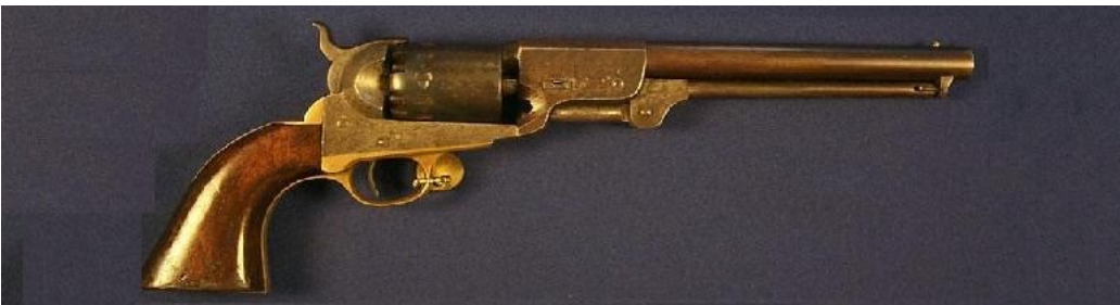
The gun pictured above is #1532.

The number of guns made is in dispute, but the highest serial number of a Leech & Rigdon revolver